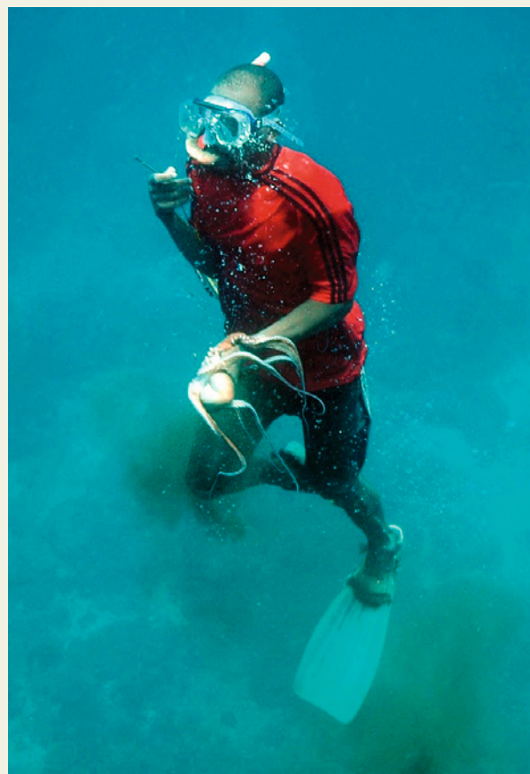
An octopus fisherman with his catch in Kenya. Global markets for Octopus are increasingly spreading through the driving higher prices, competition that can displace women from the fishery and overfishing. However, a participatory management innovation of temporary closures are also spreading with the potential to improve the sustainability and benefits of the fishery.

The octopus fishery initiative was successful as it addressed the root problem local fishers' incentives, and targeted monitoring and communication to demonstrate how the benefits of the fishery closure outweighed short-term losses. Further communication and exchange facilitated buy-in to the initiative across the region, and cooperation between fishery and conservation authorities and commercial traders. Fishery closures are managed differently in the different areas, fitting the overarching benefits to local situations and needs 9 . Local and regional success is driving further innovations in management that connect with other global developments, for example the development of eco-certification for fishery products.